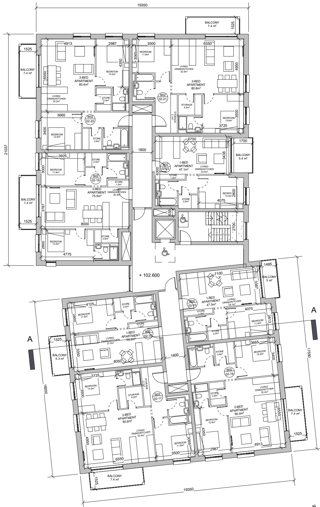
① Block 02 - Level 02 1 : 200